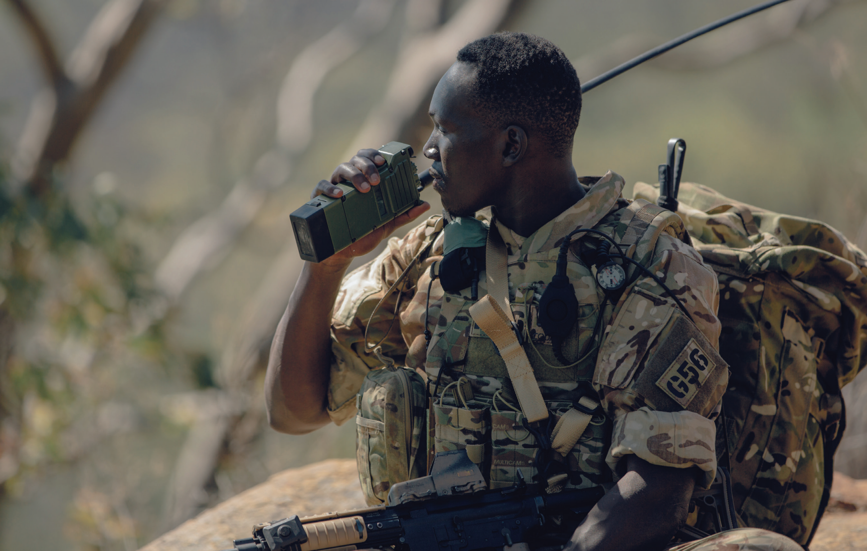
LEFT Codan's Sentry-V 6150 provides commanders and operators with a feature rich secure voice and messaging platform.

The 6160-PR offers up to 16 programmable pre-set channels and up to 64 different networks all operating on a common frequency, with each one having an assigned programmable ID thus providing a flexible network structure. It provides a mesh networking capability of up to seven hops, increasing coverage and overcoming interference from obstacles and difficult terrain; a single hop in open terrain can achieve a range of up to 2km. The