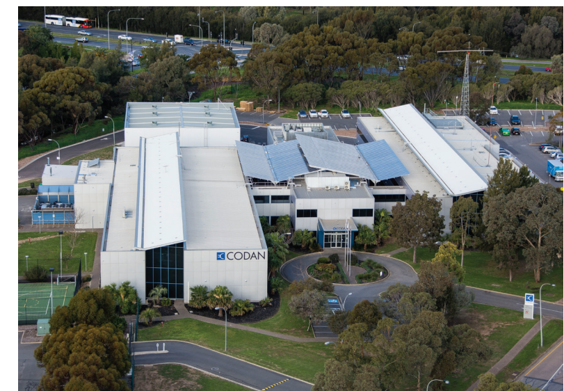
LEFT Codan headquarters and manufacturing facility in Adelaide, Australia

Codan has worked extensively with its customers worldwide to identify their needs and ensure that its solutions meet those needs without additional, costly and over-engineered utilities and features which are under or never utilised. Codan’s focus is on giving customers only the feature set they need, avoiding a “one size fits all” mind-set, offering solutions that, while principally focused at the tactical level, encompass requirements at all levels of command and meet operational and strategic needs as well.