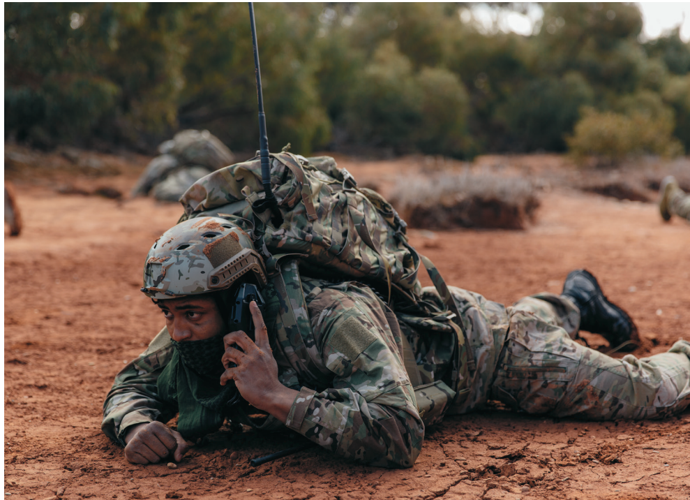
ABOVE Codan Sentry-H 6110-MP