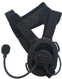
Single ear headset

With the 6160-PR emergency zeroise function the radio can be quickly erased in the field by an operator, ensuring network protection.