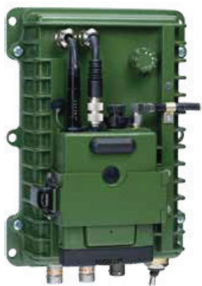
6160-PR mobil docking station