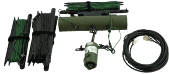
Tactical broadband antenna