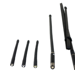
Long, medium and short antennas