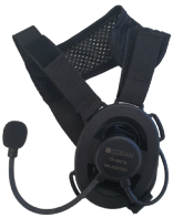
Single ear headset

Codan’s RF and software engineering teams can collaborate with client engineers to design bespoke sovereign modes and waveforms according to specific end-user requirements.