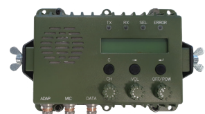
Console (mobile use)