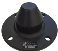
Vehicular dome antenna