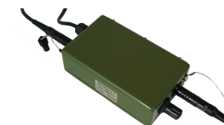
6150 family to 6160 family cross frequency interoperability