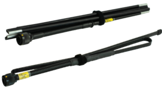
Tape and collapsible whip