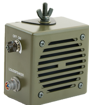
H-250 Remote Speaker