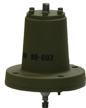
HF NATO antenna base whip