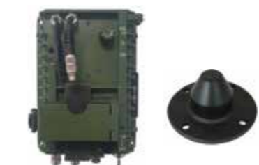
PLATOON COMMANDER VEHICLE Sentry-U 6160-PR connected to tactical tablet

Troop transport and fire support vehicles are equipped with mounted Sentry-U 6160s, using high gain antennas.