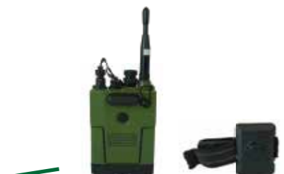
SOLDIER Sentry-U 6160-PR

A squad leader equipped with a Sentry-U 6160-PR uses a dual wireless PTT to talk to fireteam A and fireteam B separately.