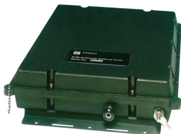
9103 Antenna Tuner

The 9103 base antenna tuner has been designed for operating with most end-fed long wire and whip antenna systems in fixed land station applications.